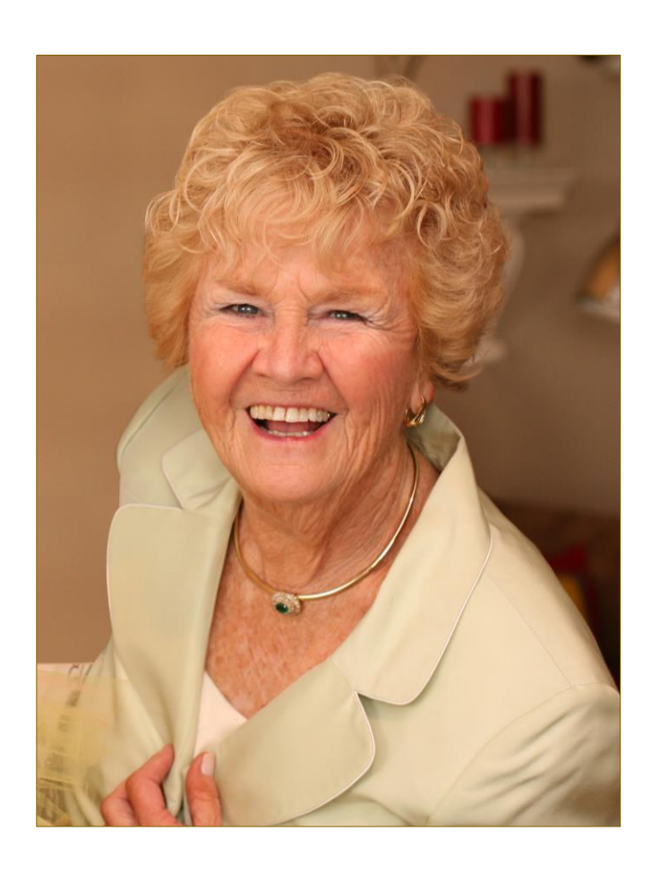
Saturday, September 10, 2022 2:00 PM Wellesley Village Church