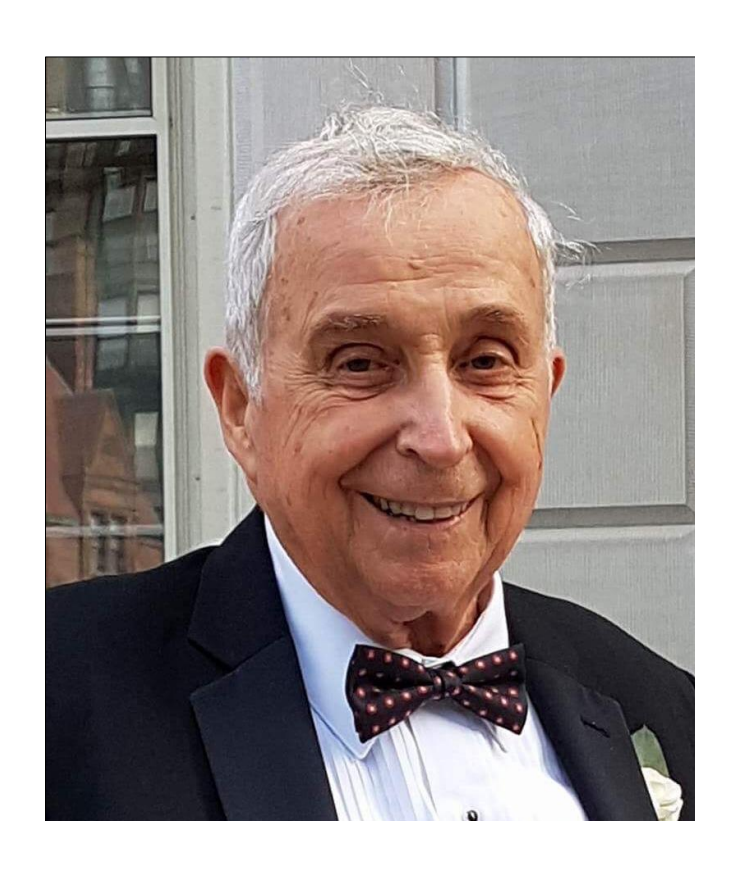
Saturday, October 7, 2023 11:00 AM Wellesley Village Church